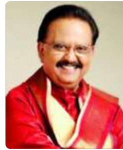
S P BALASUBRAHMANYAM